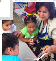
Joan Richards Learning Village