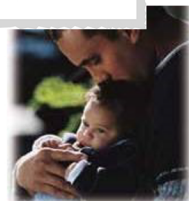
Subsidized Child Care

Child Care Keeps California Working . . . and Family Resource & Referral Center (FRRC) is a critical link to quality child care services for parents and children in San Joaquin County and the surrounding area.