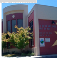
Teen IMPACT Center