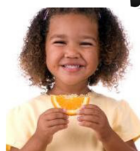
Child Care Food Program