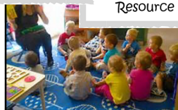
Early Head Start Child Care Partnership