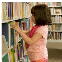
Resource & Referral