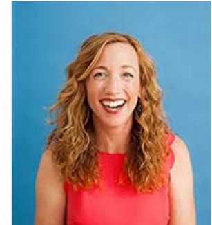
Keynote sponsored in part by