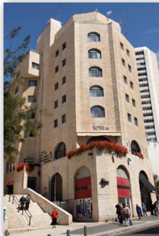
Lev Yerushalayim Hotel