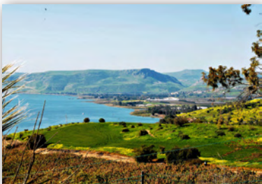
The Sea of Galilee