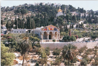
Gethsemane on the Mount of Olives