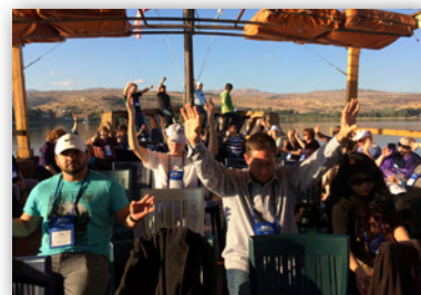
Worshipping on the Sea of Galilee