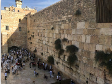
The Kotel (Western Wall)