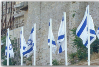
Flags Near the Kotel