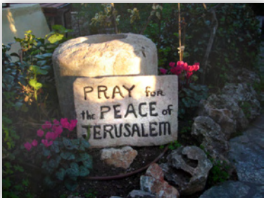
A Reminder at the Garden Tomb