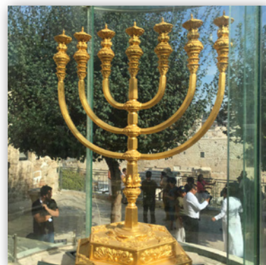
Menorah Prepared for the 3rd Temple