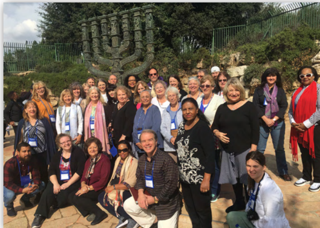
2018 Jerusalem Summons Group

Notice: Our itinerary is subject to change according to local events and weather.