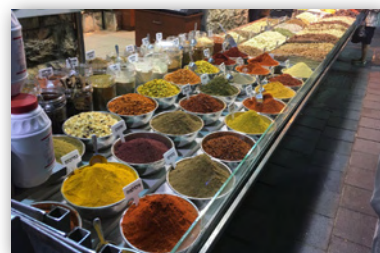
Spices in the Shuk (Open Market)