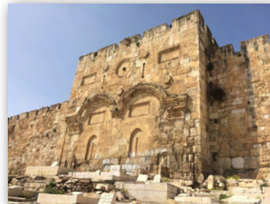
The Eastern Gate